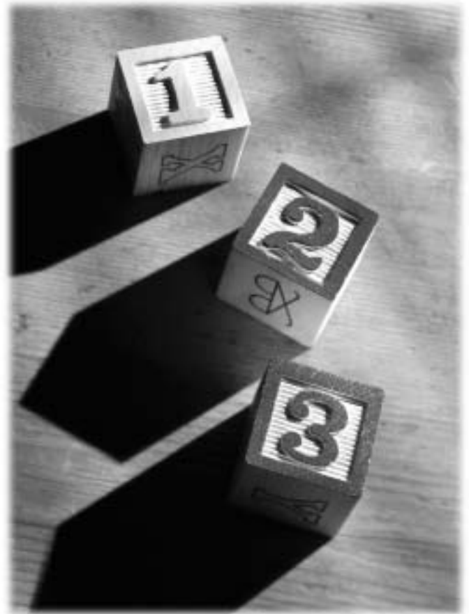
Figure 1 summarizes our findings in mathematics. The typical student progressing from grade 4 in 1996 to grade 8 in 2000 in a state with a consequential accountability system could expect to see a 1.6 percent increase in his NAEP proficiency score (calibrated to the appropriate learning standards for each grade). By contrast, the typical

student in a state with no accountability system could expect to experience only a 0.7 percent gain in mathematics proficiency, a statistically significant difference. Students in states with "report card" systems, where scores are publicly reported but no consequences are attached to performance, fell in the middle: they could expect to gain 1.2 percent in achievement between grades 4 and 8, over and above what they would normally learn from grade to grade. In short, states with high-stakes and even low-stakes systems for schools performed significantly better on NAEP than states with no stakes at all.