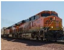
America's Abundant Natural Gas is Now Being Tested on the Rail Tracks (America's Natural Gas Alliance)