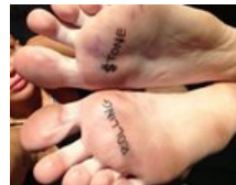
Miley Cyrus' New est Tattoo Is One She'll Regret But It Won't Matter (PHOTO) (CafeMom)