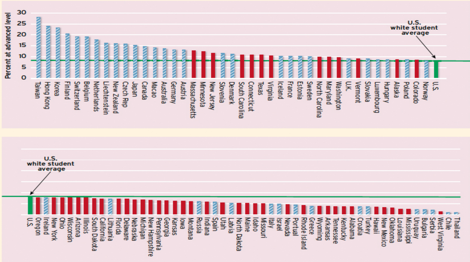
Class of 2009: Percentage of white students in U.S. states at advanced level in math and percentage of all students at that level in countries participating in PISA 2006. (Figure 2)